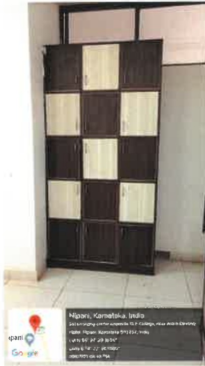
Ladies Staff Room pigeon holes

Accredited at 'A' level by NAAC with CGPA 3.35 Affiliated to Rani Channamma University, Belagavi, Karnataka, India