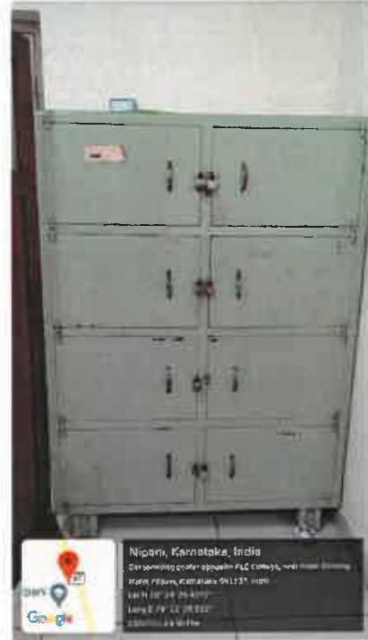
Ladies Staff Room Cupboards.