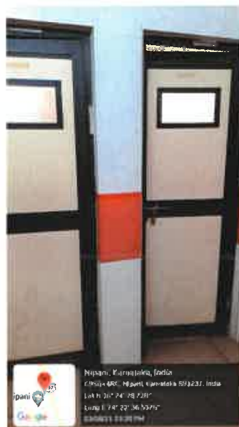
Girls Wash Room