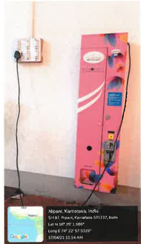
Napkin Wending Machine